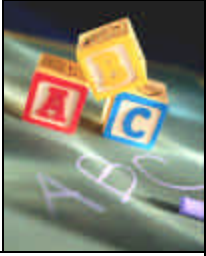
A, B, Cs of Faith

and using faith. Much like a gardener would plant seed and tend it we must tend our “seeds” of faith and care for them until they produce the substance or matter that we are believing for.